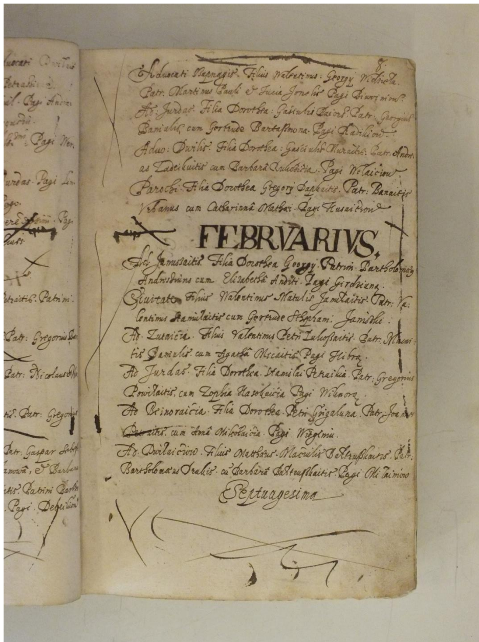
Figure 2. The Catholic parish in Joniškis, Register of baptism, 1599–1621, fragment dated 1600 (p. 8)