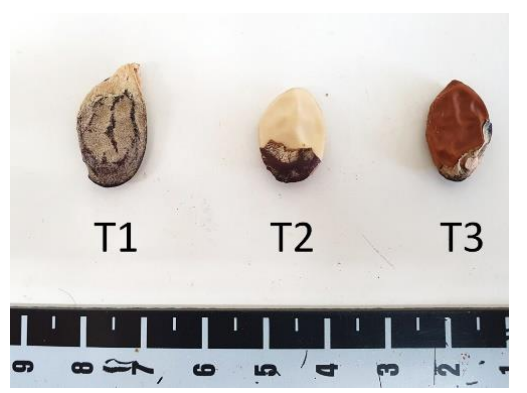
FIGURE 1 - Intact seed (T1), scarified seed with light cotyledons (T2), and scarified seed with dark cotyledons (T3).

On the other hand, manually scarified seeds with light colored cotyledons achieved an emergence percentage of 86% (Figure 2A). The seeds were scarified by breaking the tegument on the opposite side to the hilum with a small cutting mechanical device, consisting of two removable parts, a lever and a blade. Intact seeds demonstrated a lower percentage of emergence (44%), demonstrating that storage significantly reduced their viability, contrary to what was reported by Lorenzi (2002), who found greater viability after 3 months of storage. Vasconcelos et al. (2019), also concluded that A. cearensis seeds had low viability and germination vigor when stored, characterizing losses of almost 50% of viability.